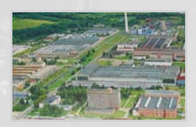
UNEX a.s. - Snina plant

phone: +420 585 712 147 e-mail: olomouc@unex.cz