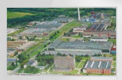
UNEX a.s. - Snina plant

phone: +420 585 712 147 e-mail: olomouc@unex.cz